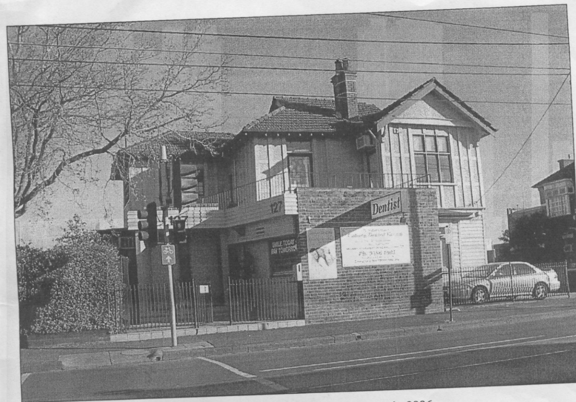
127 Sydney Road built 1906, as it appears in 2006

the property in 1922, although the rate books indicate it was 1923.